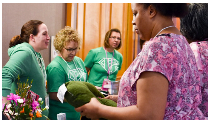
Heroes unite! Many HRH associates attended and volunteered at the 14th Annual I.W.I.N. Foundation Pink Pajama Party in February. All ticket sales and donations support women in our community who are receiving breast cancer treatment.