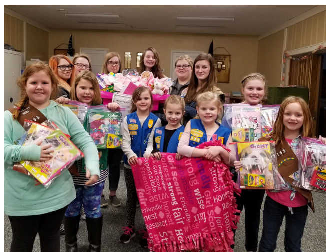
Girl Scouts from the Danwood Service Unit donated a gift basket full of clothes, books, diapers and toys, in addition to a free Girl Scouts membership, to a baby girl born at HRH in honor of “National Girl Scouts Day” celebrated on March 12.