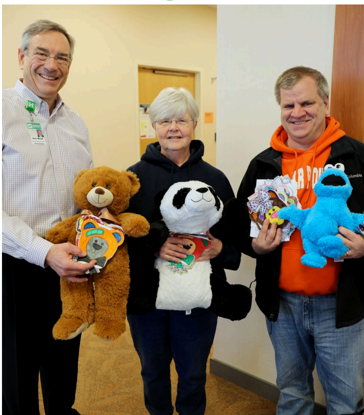
We are thankful to the members of Avon United Methodist Church who recently donated stuffed animals to give to HRH patients.