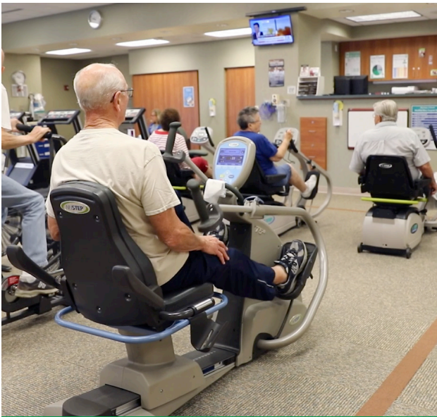
Cardiac rehabilitation helps patients recover and build strength to get their hearts back to good health.